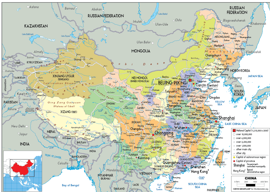
Map 1. Political map of China 1